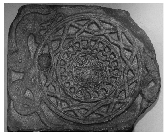
Fig. 4. A pair of interlaced dragons encircling a large medallion containing a star pattern. Relief carving, wooden door. Tigris region, the Jazīra. First half 13<sup>th</sup> century. Berlin, Museum für Islamische Kunst, inv. no. I.1989.43. Fig. 5. A pair of interlaced dragons encircling a large medallion containing a star pattern. Relief carving, stone fragment. Anatolia. First half of the 13<sup>th</sup> century. Konya, İnce Minare Muzesi, inv. no. 5817.

The motif also features conspicuously on several Kashan-style ceramic vessels; here the encircling imagery is rendered in the form of interlacing bands comprising multiple pairs of «Saljuq-style» dragons circumscribing a central composition (Grube 1965: pl. 28. Enderlein et al. 2001: 51; Pope 1945: 121, pl. 84). On one early 13<sup>th</sup>-century bowl, the ophidian bodies encircle a well-known motif, often portrayed on early 13<sup>th</sup>-century Kashan-style ceramic artefacts, of two seated human figures conversing. The serpentine interlace is in turn framed by epigraphic bands in Kufic and cursive script in Arabic and Persian. The main theme of the inscriptions is love, the longing for the beloved and the anguish and suffering occasioned by love (Pancaroğlu 2007: 133, cat. no. 86. Cf. Meisami 1987: 237–298). This microcosmic ideal is aptly framed by the interlaced dragons. It may be inferred that, although generally perceived to be a mere decorative device on Saljuq-period objects, the iconography of encircling dragons may well have conveyed some cosmological and, possibly, mythological significance.