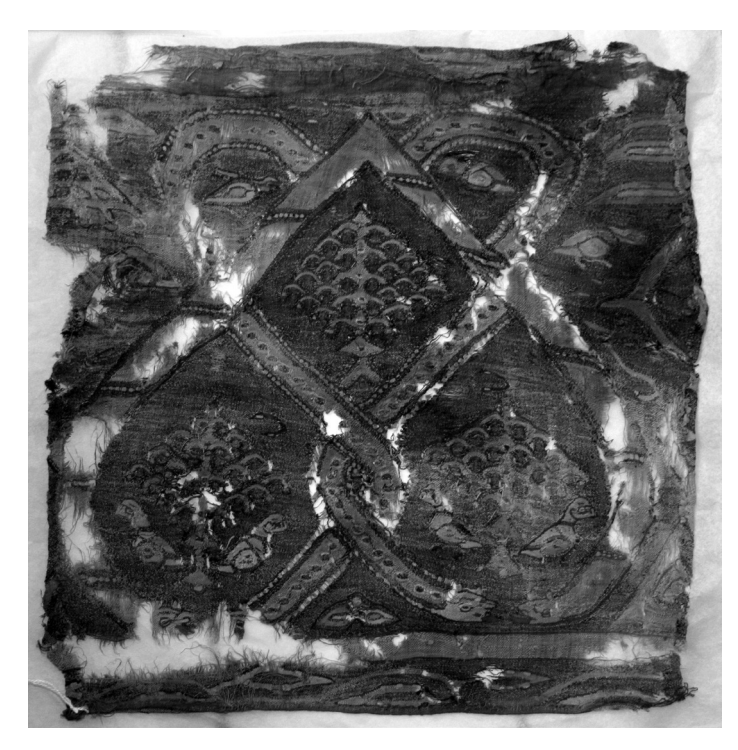
Fig. 8. A lozenge-shaped all-over pattern interlace formed by two pairs of confronted dragons. Textile fragment, woven silk. Afghanistan, Samangan province, Dar-i Suf. C-14 date from 1154 to 1282 (Institute of Particle Physics (ETH), Zurich, 87.7%; 29 January, 2000). Kuwait, al-Sabāh Collection, Dar al-Athar al-Islamiyyah, Kuwait National Museum, inv. no. LNS 519 T.

the details of the iconographic expression, including trees flanked by perched birds in the lobes of the interlace and the beaded or striped demarcation of the ophidian bodies as well as their projecting red tongues, are near-identical to those of the «Bird Cloth».