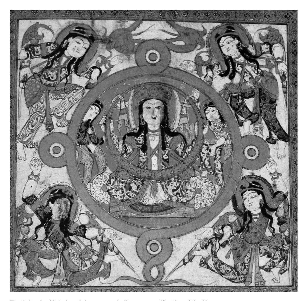
Fig. 6. A pair of interlaced dragons encircling a personification of the Moon. Detail of the right half of the double-page frontispiece painting in the Kitāb al-diryāq . The Jazīra, Mosul (?). Rabī'al-awwal of the year 595/31 December 1198–29 January 1199. Paris, Bibliothèque Nationale, Ms. Arabe 2964; current pagination 36–37.

so-called relic cover of Saint Amandus, one part of which is preserved in the Abegg-Stiftung in Riggisberg, the other in the Cleveland Museum of Art.<sup>25</sup> Thought to have a Western Asian provenance the fragment features double-headed eagles surmounting pairs of addorsed feline quadrupeds whose tails terminate in dragon heads. A pair of giant double-headed dragons frames this composition.