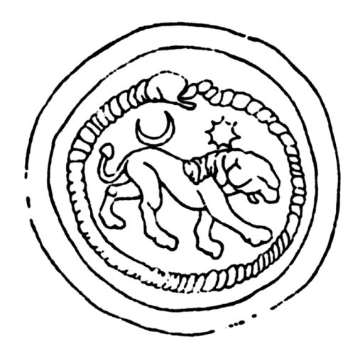
Fig. 1. An ourobóros serpent encircling a crescent and stars above a lion.

Seal, Hematite. Probably 5<sup>th</sup> century. Iranian world. London, British Museum, inv. no. 119804. After Azarpay, 1978: fig. 6 (drawing after Bivar, 1969: 26, pl. 11, DL2).