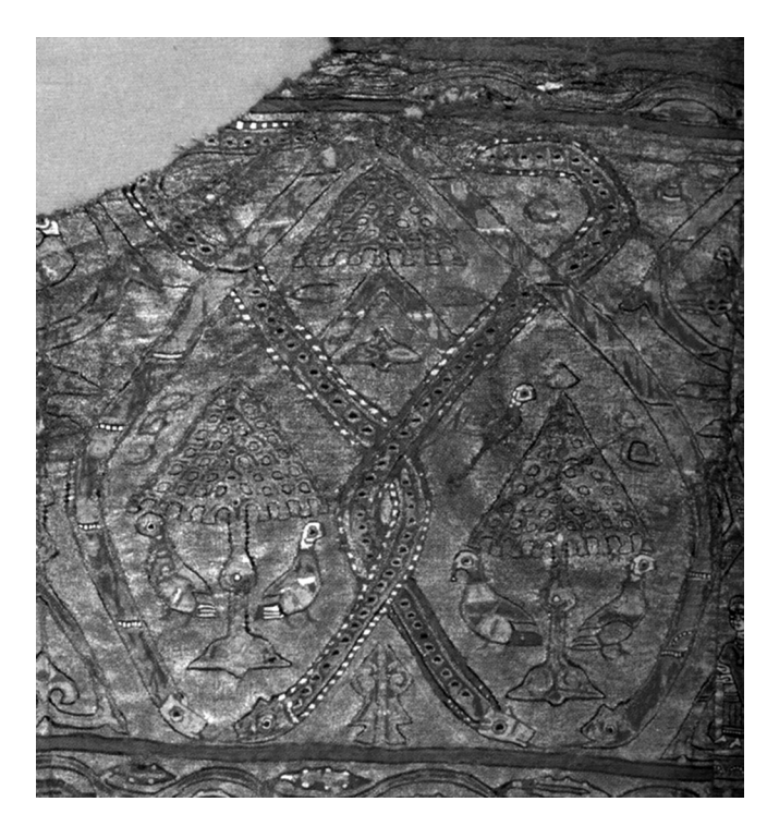
Fig. 7. A lozenge-shaped allover pattern interlace formed by two pairs of confronted dragons.

The «Bird Cloth» (detail). Lining fabric of the coronation mantle of king Roger II of Sicily and southern Italy, woven silk. Perhaps 13<sup>th</sup> century. Vienna, Kunsthistorisches Museum, Schatzkammer.